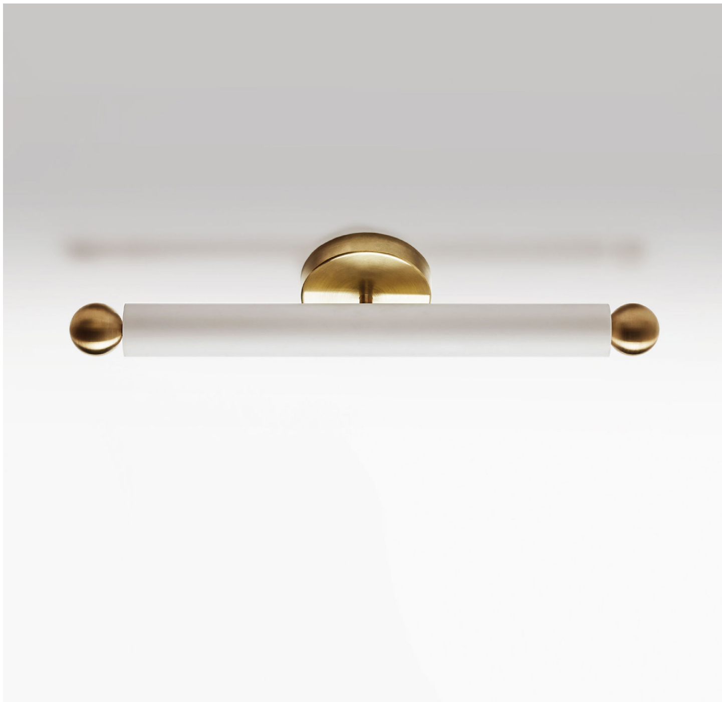
TUBE FLUSH MOUNT hewn brass